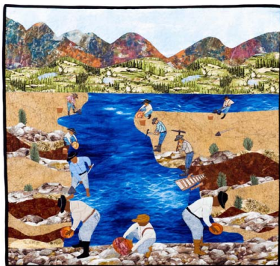
Connie Horne, Black Miners , 2021, ©Connie Horne.

Beginning in April, Shangri La Gardens will feature a Quilt Garden. These gardens will showcase a fusion of traditional quilting patterns using plants as the medium. Among the myriad of quilting designs featured will include the North Star, Shoo y, Log Cabin, Bow Tie, Flying Geese, Pinwheel and 9 Block patterns. Each garden promises to be a kaleidoscope of color, intertwining the narrative of Black Pioneers, while fostering a deeper appreciation of both art forms. Visit shangrilagardens.org for more information.