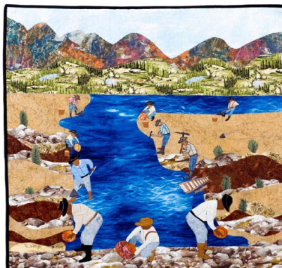
Connie Horne, Black Miners , 2021. ©Connie Horne.

Beginning in April, Shangri La Gardens will feature a Quilt Garden. These gardens will showcase a fusion of traditional quilting patterns using plants as the medium. Among the myriad of quilting designs featured will include the North Star, Shoo y, Log Cabin, Bow Tie, Flying Geese, Pinwheel and 9 Block patterns. Each garden promises to be a kaleidoscope of color, intertwining the narrative of Black Pioneers, while fostering a deeper appreciation of both art forms. Visit shangrilagardens.org for more information.