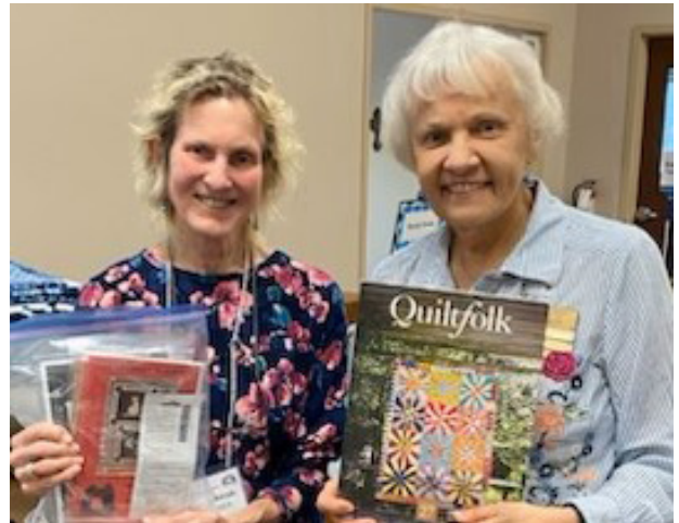
Contratulation to our Golder Carrot & Door Prize Winners!